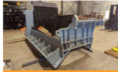
MESA J TLO Chute & Supports