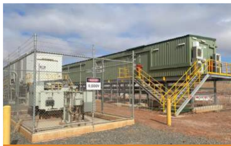
Sunrise Dam Power Station