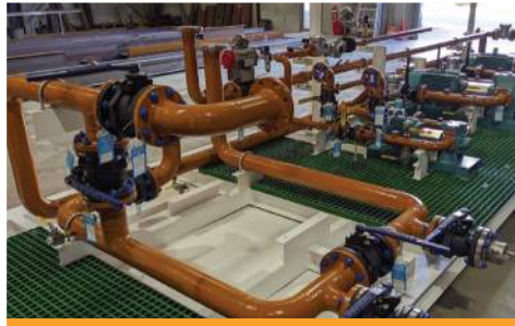
Kings Fuel Farm Pump Skid

Trial Assembly Structural Steel Assembly Handrail and Grating Fit-out Module Dressing Mechanical Fit-out Piping Fit-out Electrical Fit-out QA & Pre-Commissioning Packaging for Transport