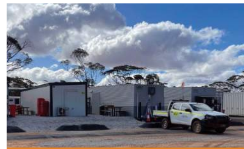
Mt Marion Lithium