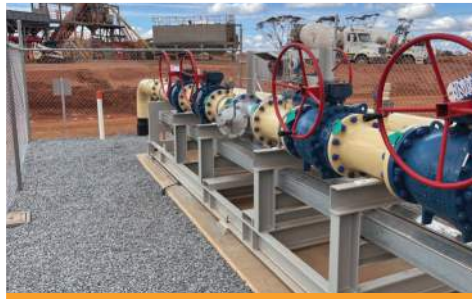
Lynas Rare Earths Gas Facility