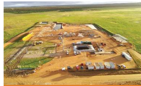
Walyering Processing Facility