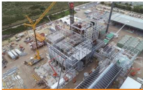
East Rockingham Waste to Energy

Workshops Fuel & Lube Facilities Washbays Service Utilities Process Plants Compressor Stations Delivery Stations Power Stations Greenfields & Brownfields Hazardous Area Works