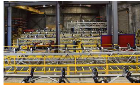
Marvel Loch Conveyors