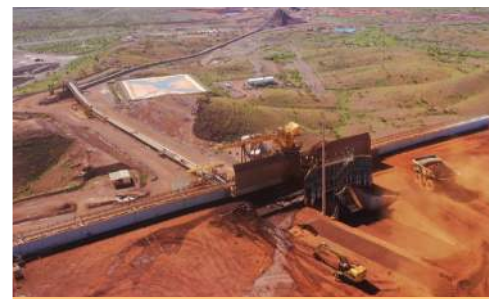
Gudai Darri ROM Containers