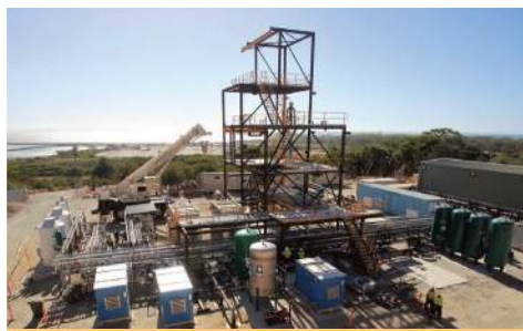
Hazer Hydrogen CDP

Structural Steel Chutes, Hoppers & Launderers Platework Grating & Handrail Pressure Piping Carbon, Stainless & Exotics Cast In Items Precast Concrete Urgent requirements