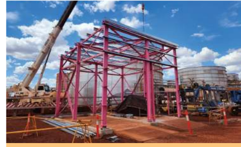
Roy Hill Desalination Plant